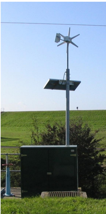
A low energy remote power site where a grid connection would otherwise cost thousands of pounds