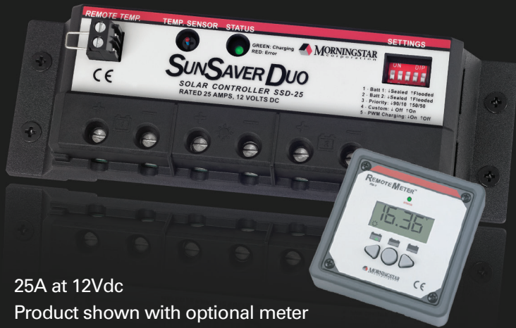
25A at 12Vdc Product shown with optional meter